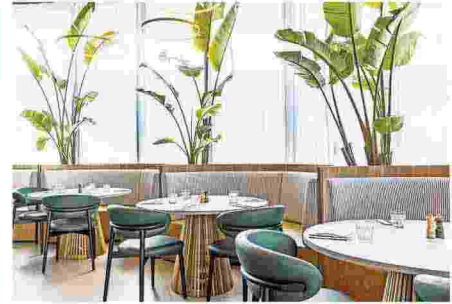
At the Social Hub Rome, an all-day restaurant offers dishes like rabbit porchetta.