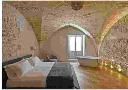
In Lecce, the newly renovated Palazzo Zimara dates to 1557, and mixes the old and new.