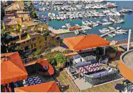
Newly renovated La Roqqa is a 50-room-and-suite hotel in Porto Ercole.

be about $786 per person a night.) The other Chianti estates are Villa Castiglionni, with six bedrooms from $65,000 a week; Villa Il Santo, with eight bedrooms from $70,000; Villa Tavernaccia, with eight bedrooms from $90,000; and Il Cellese, with 10 bedrooms from $90,000. The new estates are currently available for 20 percent off those prices.